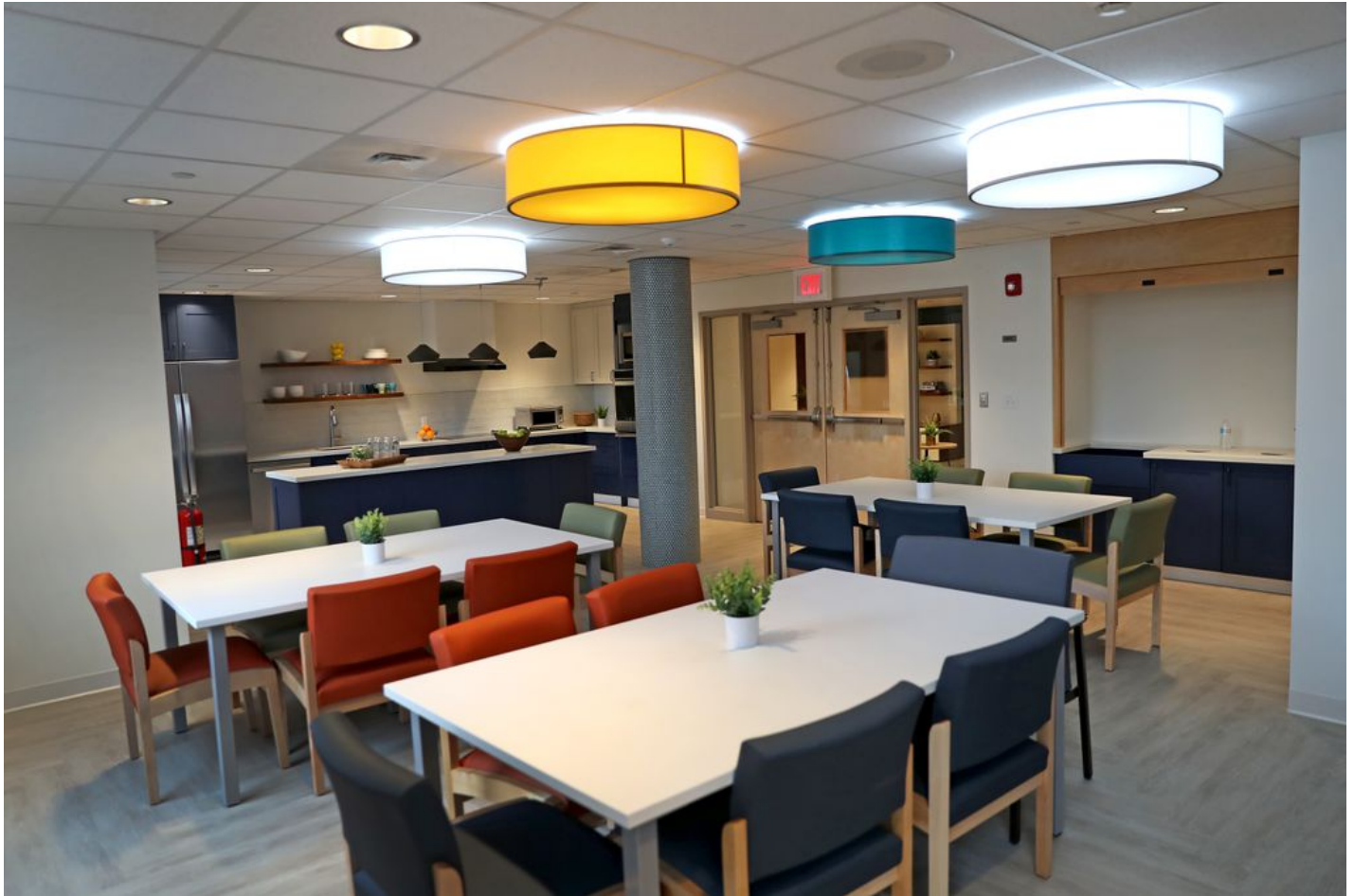
The residential kitchen.