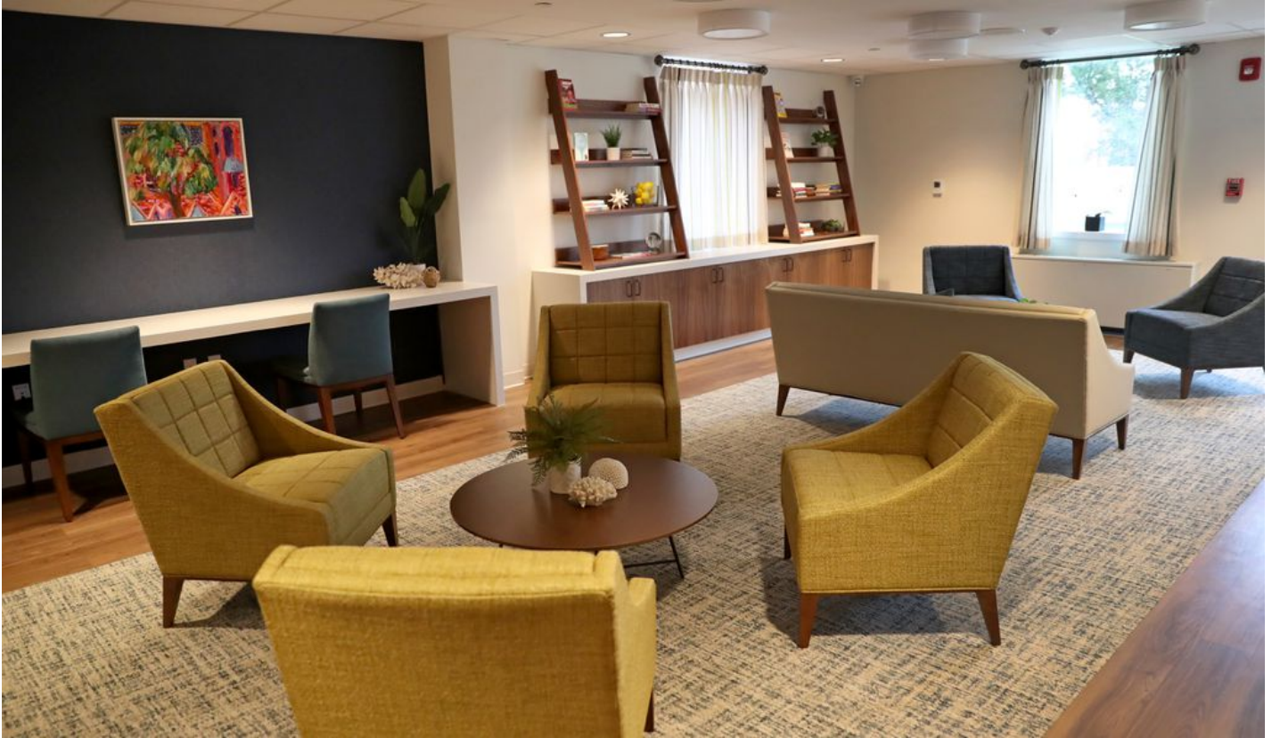
Family resource center.