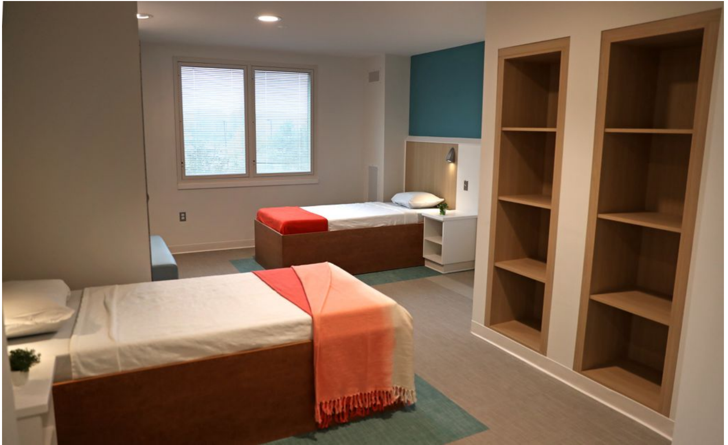
The new facility will have 82 beds, more than 3 times the size of the unit it has now in Waltham.