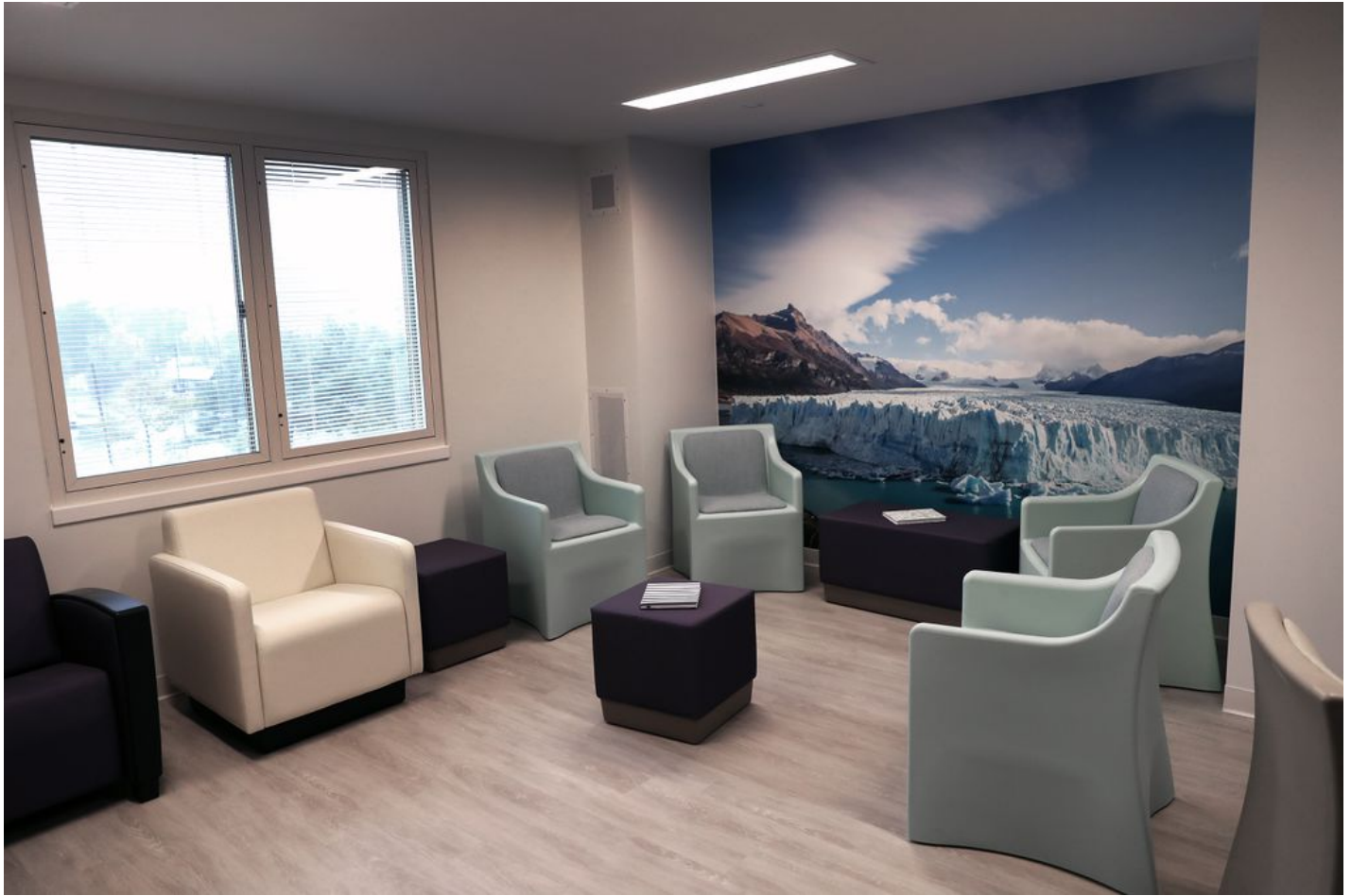
A view of the inpatient group therapy room.