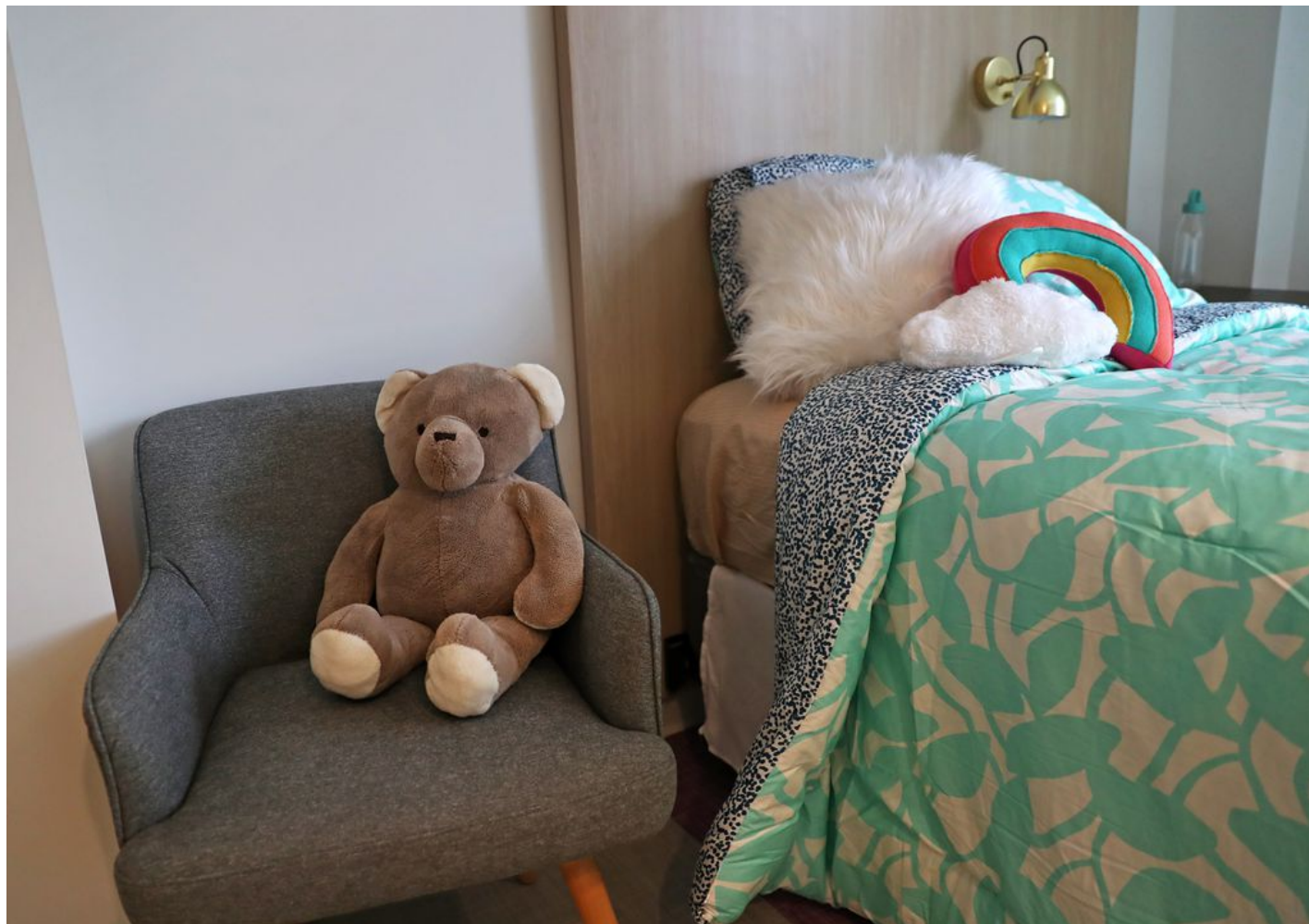
A stuffed teddy bear sat on a chair in a residential bedroom in the center.